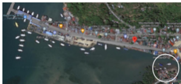
Figure 1. The docking area (encircled) of boats in MacArthur's Wharf, Guimaras

wharf are categorized as Class SC which includes fishery water, recreational water, and marshy and mangrove areas. It has beneficial uses including boating and the propagation of fish and other aquatic resources intended for commercial and sustenance fishing.