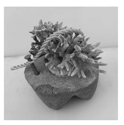
Fig. 1: Coral branch planted into a cement cone

Placement of Corals in the Caged Racks. The treatments and controls replicates (n=15 coral branches each) have separate metal racks. The metal racks were covered with 1x1 cm grid metal screen to avoid other herbivores from entering. The racks were placed on designated areas around the island. Each of the coral branches within the cement cones were interspersed 15-cm apart across the metal rack. As a means to minimize the extraneous variables and for easier measurement, there is a divider between each of the coral branches. The measurement of the whole metal rack is 115x46x50 cm (LxWxH). Three metal racks were used so that there would be 15 organisms for each experimental group for the statistical analysis.